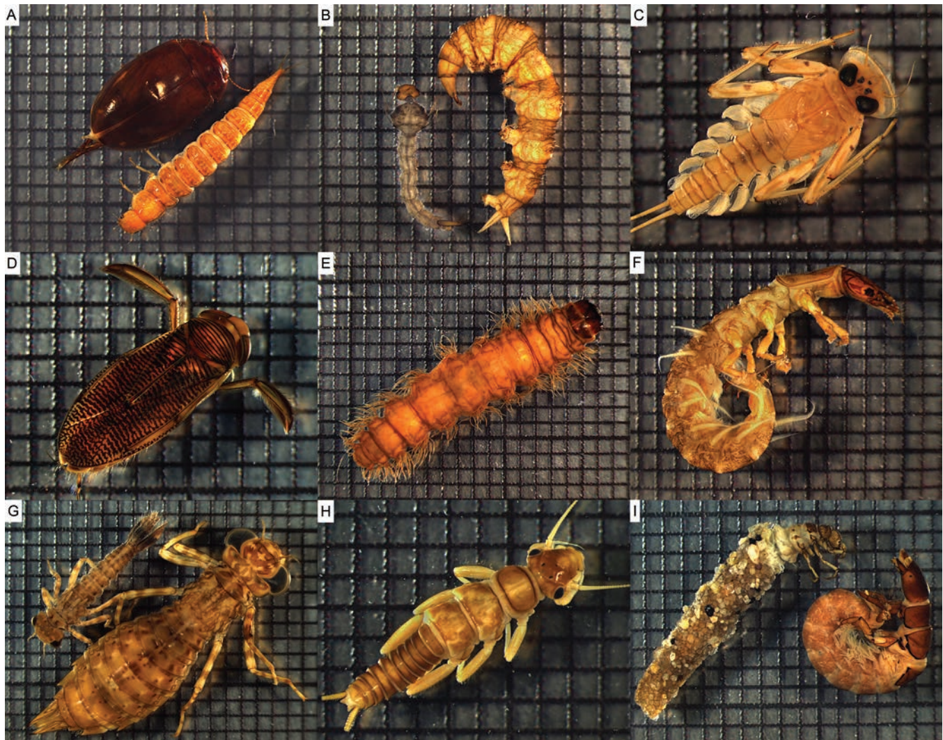
Figure 1. Insect orders represented in the North American Aquatic Macroinvertebrate Digital Reference Collection (NAAMDRC). A.—Coleoptera. B.—Diptera. C.—Ephemeroptera. D.—Hemiptera. E.—Lepidoptera. F.—Megaloptera. G.—Odonata. H.—Plecoptera. I.—Trichoptera.

We photographed specimens with 3 models of INFINITY™ series cameras (models 1-2C, 3-3URFC, and 2-1RC; Lumenera Corporation, Ottawa, Ontario) coupled with either stereomicroscopes (model EMZ-TR; Meiji Techno, San Jose, California; model M8, Wild Company, Heerbrugg, Switzerland) or a compound microscope (model Vanox; Olympus, Waltham, Massachusetts). We photographed specimens >2 mm in length superimposed over a 1-mm gridded stage to provide spatial reference when comparing other individuals for verification (Fig. 1A–I). We photographed taxa from multiple views (e.g., dorsal, ventral, and lateral; Fig. 2), and we annotated \geq 1 photograph in each series to illustrate important family- or genus-level characteristics noted in commonly available dichotomous keys (e.g., Merritt et al. 2008). We photographed slide-mounted specimens from the family Chironomidae with a compound microscope zoomed between 100 and 400 \times magnification.