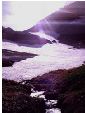
North St. Vrain headwaters, Rocky Mountain Natl Park, USA

email ( finnd@science.oregonstate.edu ) with any suggestions or contributions. We are having a great time with this and are looking forward to incorporating ideas from other NABsters!